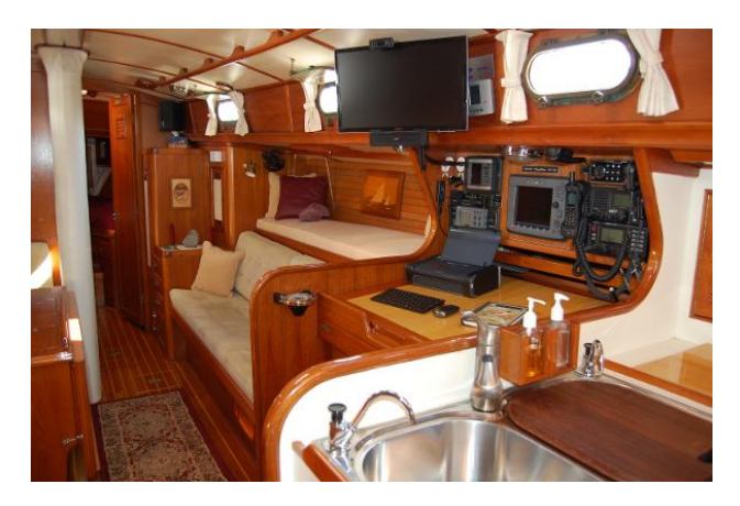
Galley Nav Stn Pilot Berth