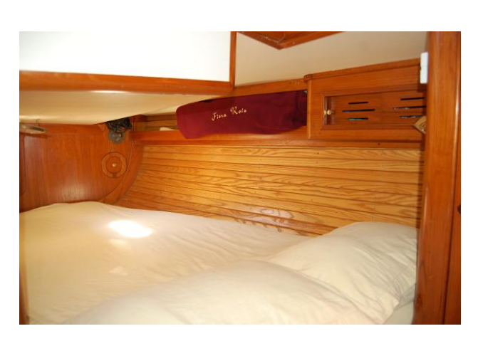
Aft Double Berth