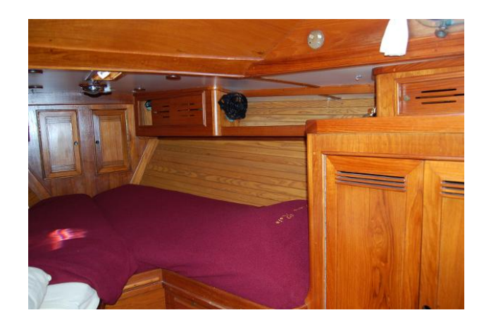
Forward V Bearth